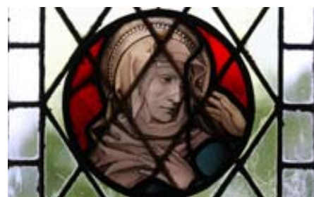
Large roundel depicting the Virgin Mary