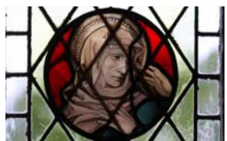
Large roundel depicting the Virgin Mary