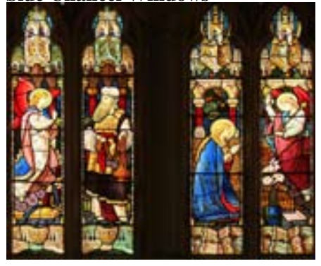
All the side windows of the chancel depict Old & New Testament scenes which include angels.Namely:

Hagar in the Wilderness; Annunciations to the Virgin and to Zachariah; The Garden of Gethsemane; The Sacrifice of Isaac; Abraham and the Three Young Men. In common with all the nave windows puttis' heads are pictured in the tracery lights